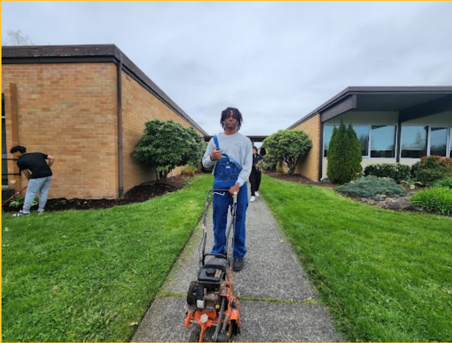
Students provided quality yard service