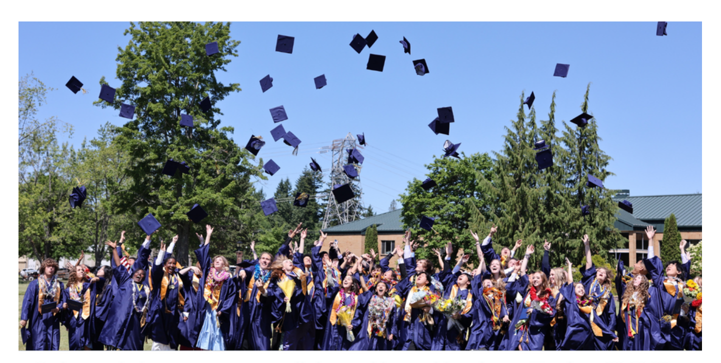
God commissions us to go unto all the world...teaching them...Matthew 28:19-20

Seek Divine Wisdom. Inspire Innovative Minds. Build Eternal Relationships.