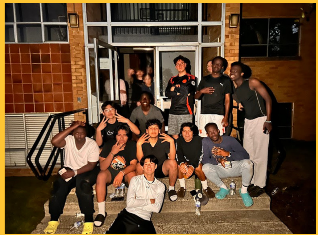
When the lights went out in Witzel Hall